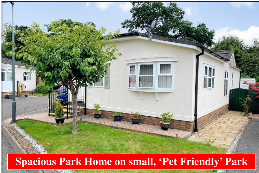
Spacious Park Home on small, 'Pet Friendly' Park

4 Crystal Hollow, Southampton Road, Godshill, Fordingbridge. SP6 2JJ